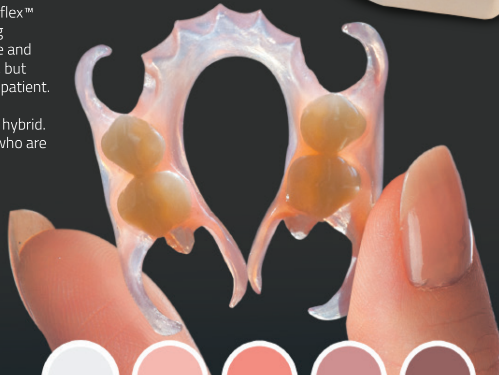
Available in 5 Gingival Shades